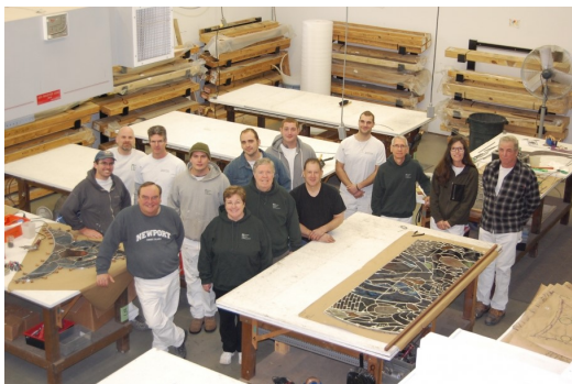
Stained glass restoration at Stained Glass Resources

The good news is that an anonymous parishioner has challenged the congregation to raise $25,000, which will then be matched and the work can begin.