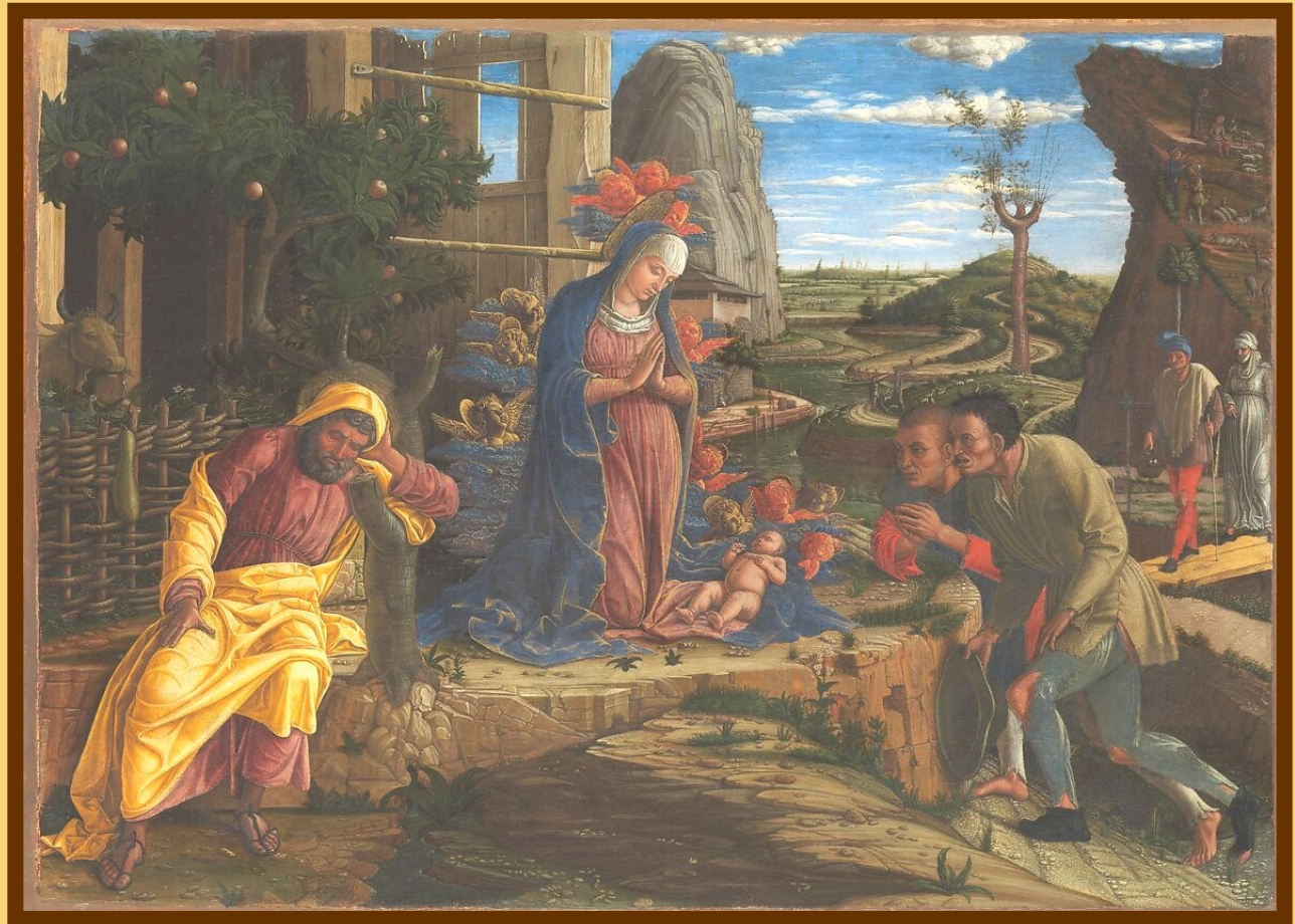
Adoration of the Shepherds by Andrea Mantegna ca. 1450