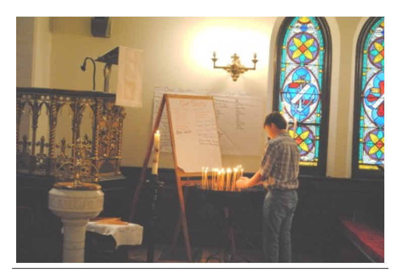
Naming our own Saints on All Saints Day