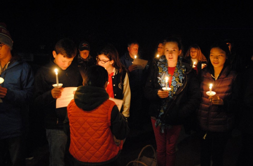
Lighting of the Christmas Tree!

ministry at Noble Horizons and Geer, along with leading midweek worship services at Noble Horizons and Geer.