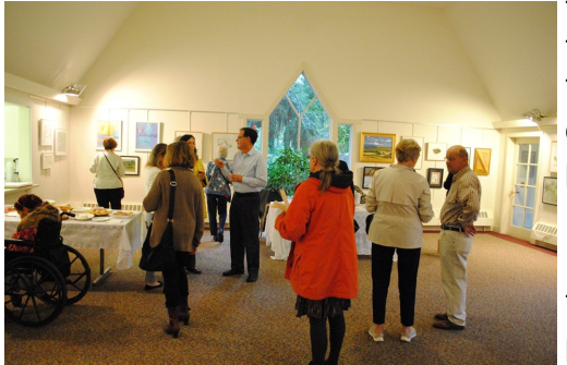
Sunday afternoon visitors

There were four Juried Art Shows with a Call for Entries format held at Trinity in 2015 of which one was a newly introduced Photography Show. These shows were open to all artists and the photography show was open to all photographers. All had small entry fees. Jurors selected the pieces to be hung.