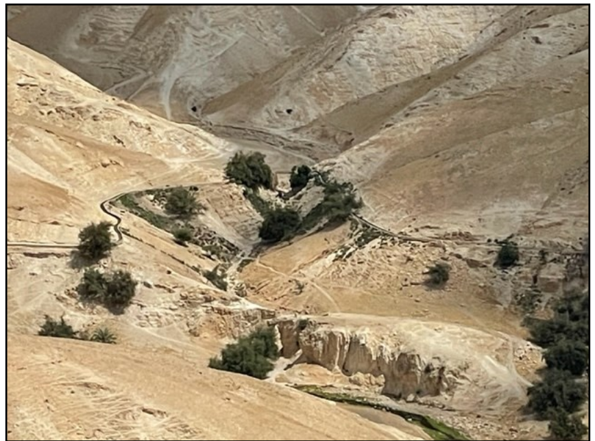
Another view of the parched Judean desert where sometimes water flows through this wadi.