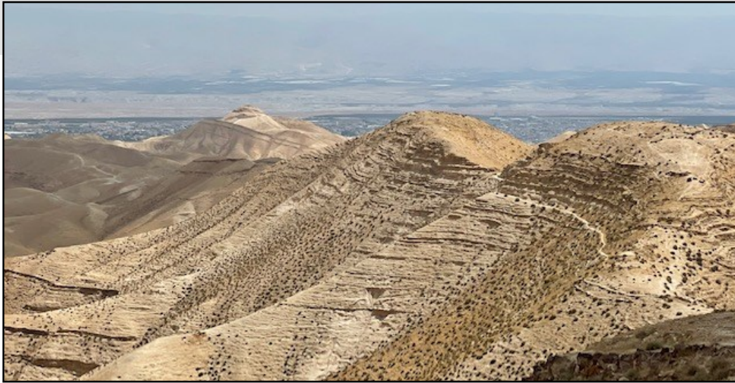
The Judean desert east of Jerusalem on the way down to the Jordan River

Prelude Organ improvisation on tune Kelmarsh