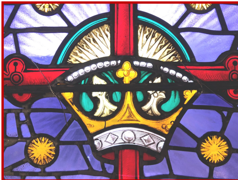
Cross and crown detail from Trinity's stained glass windows.