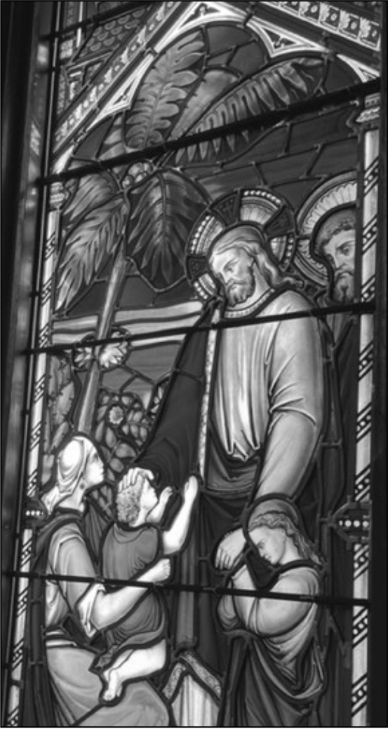
with Jesus and children.