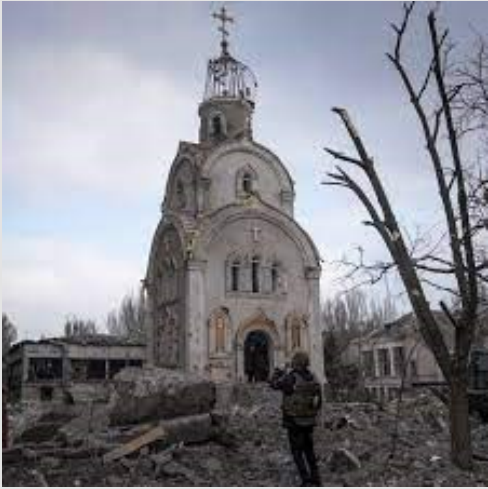
Bombed out church in Ukraine